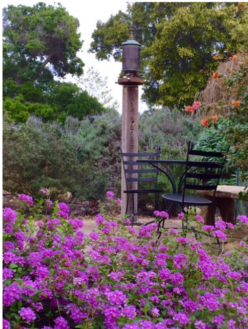
Prayer wheel on Lambert Road Campus.