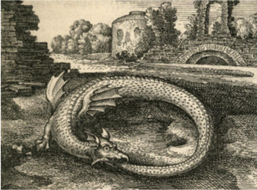
Figure 1. The Uroborus, the tail-eating serpent. From Atlantis Fugiens, by M. Maier, 1618. Published by de Bry. Reprinted in The Hermetic Museum: Alchemy and Mysticism, by Alexander Roob, 1997, p. 343.

The figure is centered horizontally on the page.