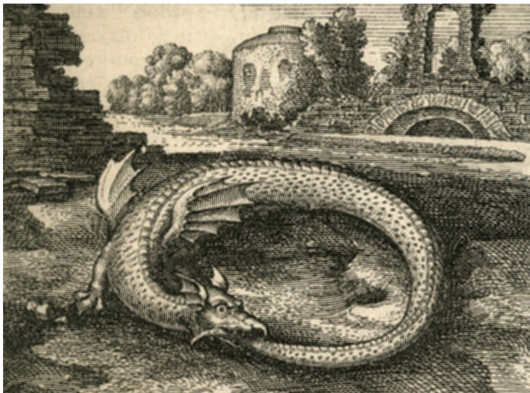
Figure 1. The Uroboros, the tail-eating serpent. From Atlantis Fugiens, by M. Maier, 1618. Published by de Bry. Reprinted in The Hermetic Museum: Alchemy and Mysticism, by Alexander Roob, 1997, p. 343. Copyright 1997 by Taschen. Reprinted with permission.

The figure is centered horizontally on the page.